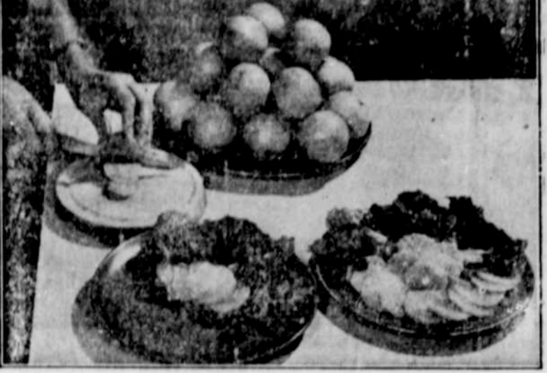
By BETTY BARCLAY