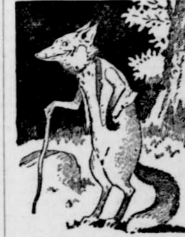
"M-m-m!" said Reddy to himself, "I smell Meadow Mouse."

Now, it never does to forget. No, sir, it never does to forget. Forgetting is what brings most of the trouble to the little people of the Green Meadows and the Green Forest. No matter how busy or how happy they are or how peaceful everything seems, they must never, never forget to watch out for danger. But most of them are very much like little boys and girls and some older people—they do forget, particularly when they are having a good time. Old Mr. Trouble always seems to be looking especially for those who are having a good time, probably because he knows that that is the time when they are most