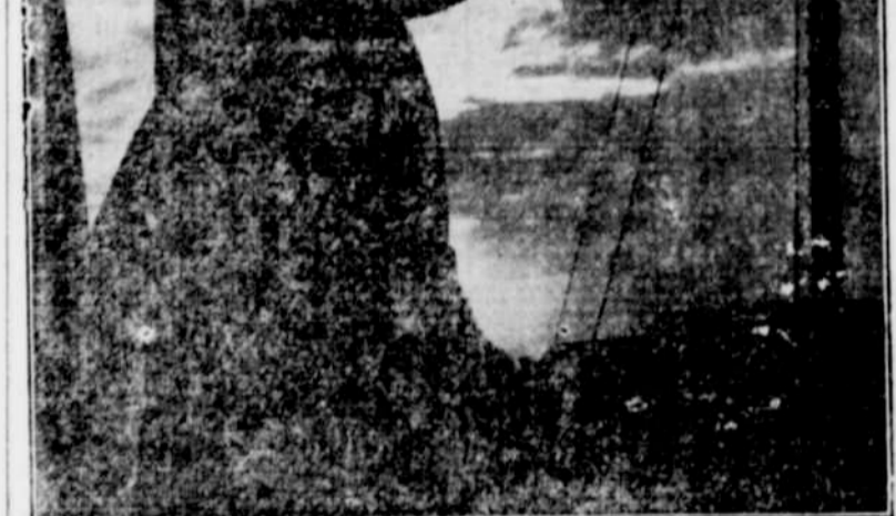
Silhouettes against the sunset make striking snapshots.

On the other hand, the scientific attitude is one which weighs all of the evidence, considers all of the facts, examines the case from every side. A finding thus arrived at may favor or reject a particular scheme, but the announcement of such a finding, supported by the pros and cons of the evidence, is not propaganda. The difference is like that which exists between the lawyer who is concerned with winning his client's case, and who will suppress, if possible, all evidence that does not promote this result, and the judge, who is concerned with the truth of the issue and not with the victory of one litigant or the other. The lawyer's argument at the trial may be propaganda, but the judge's decision is not. As the tax law now stands, it is as if Congress had recognized no distinction at all between the methods and aims of the trial lawyer and those of the judge on the bench.