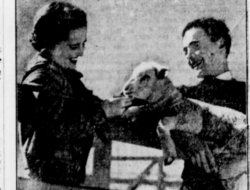
Everywhere on a farm there are pictures—simple, pleasing snapshots that will give your albums new appeal.