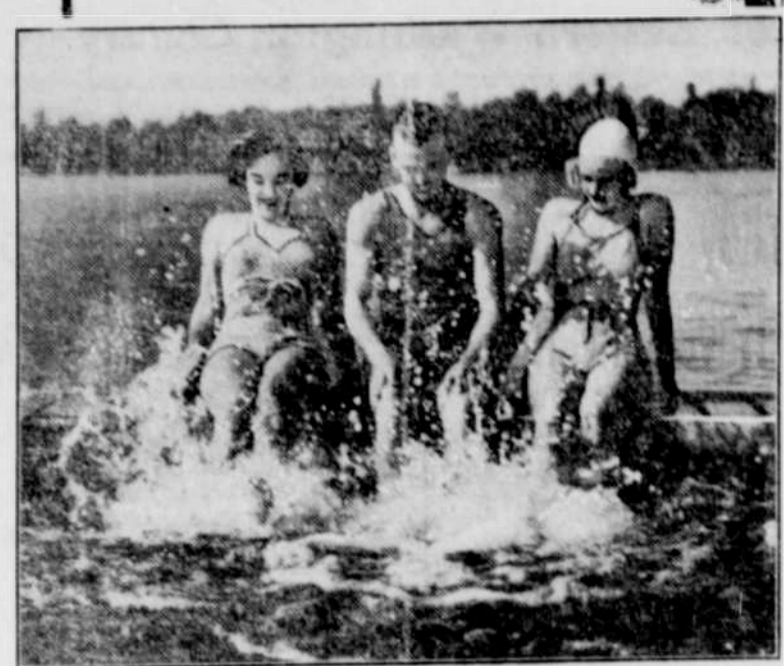
It's the man behind the camera that counts. This picture, for example, was snapped with an inexpensive and simply operated camera.

IT'S a joy to own a fine precision camera with a fast lens and shutter. No one will deny that. Such cameras are versatile and open the way for picture taking under many conditions. Extremely fast action holds no terror for them. They laugh at poor light. If you want to specialize on speed photography or indoor shots without special illumination, or shoot under adverse conditions in general, a precision-built, ultra fast lens camera is the thing to own.