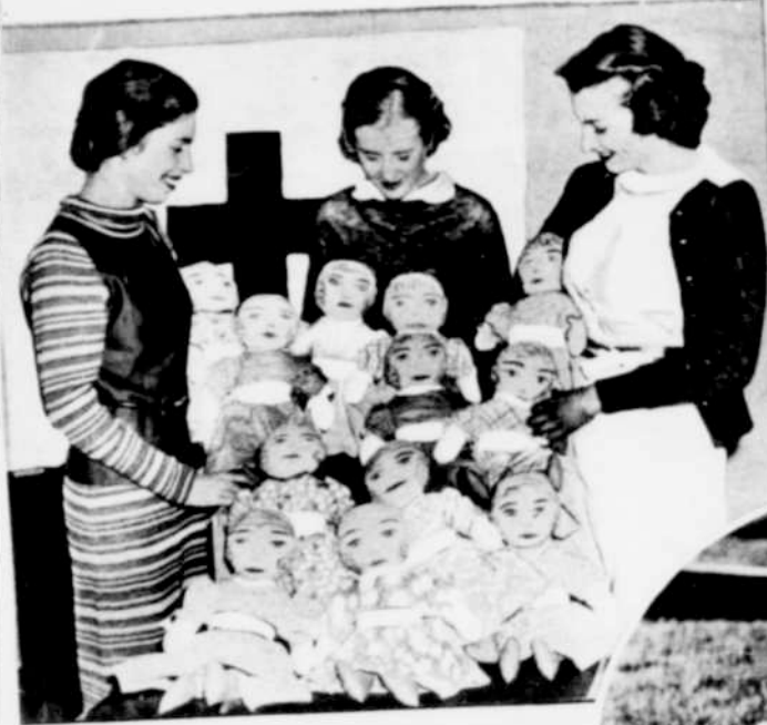
DOLLS BRING HAPPINESS —Junior Red Cross girls whose motto is "I Serve" make hundreds of rag dolls for children who have no toys.

A YEAR OF RED CROSS SERVICE 145,000 families aided in Spring floods and tornadoes. Relief fund of $7,800,000 given by public for these disaster victims. Help given in 136 other disasters in nation. Red Cross public health nurses made 1,000,000 visits to sick. 212,000 First Aiders and 80,000 Life Savers trained. First Aid and Life Saving taught 75,000 C.C.C. enrollees. 700 First Aid Stations in operation on highways to cut motor accident death toll—3,500 stations being organized. Chapters gave Civilian relief in 800 communities. Home Hygiene and Care of the Sick taught to 50,000 persons. 8,000,000 school boys and girls enrolled in Junior Red Cross. Service to disabled veterans and service men continued. Thousands of volunteers made garments, braille books and gave varied services. These activities carried on in 13,000 communities by Red Cross Chapters and Branches.