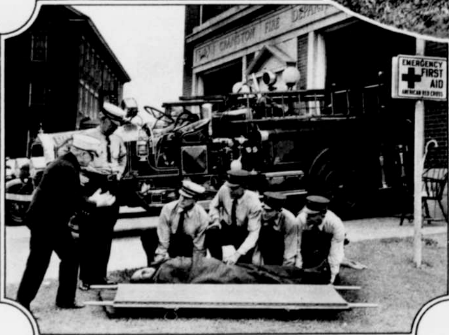
FIGHTING AUTOMOBILE DEATH TOLL —800 Red Cross Emergency First Aid Stations on the nation's highways, soon to be followed by 3,500 more, will reduce fatalities following motor accidents.