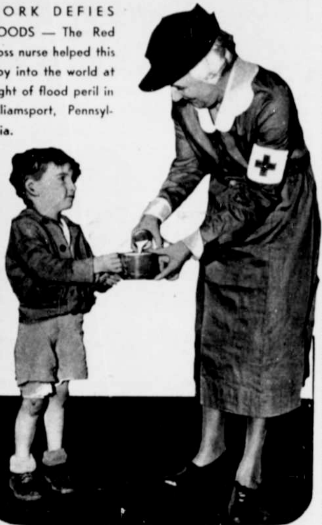
A WISTFUL LITTLE FLOOD REFUGEE —One of thousands of youngsters cared for by Red Cross volunteers in disaster refugee centers.