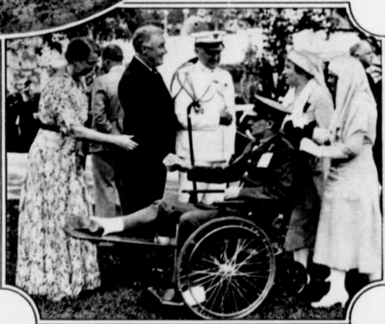
WAR VETERANS REMEMBERED —The Red Cross Gray Ladies bring war's victims to President's annual garden party. President and Mrs. Roosevelt greet war disabled on White House lawn.