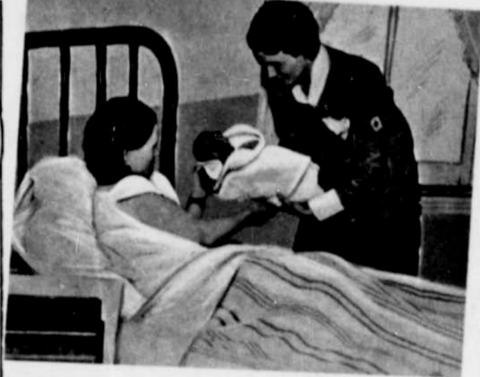
STORK DEFIES FLOODS —The Red Cross nurse helped this baby into the world at height of flood peril in Williamsport, Pennsylvania.