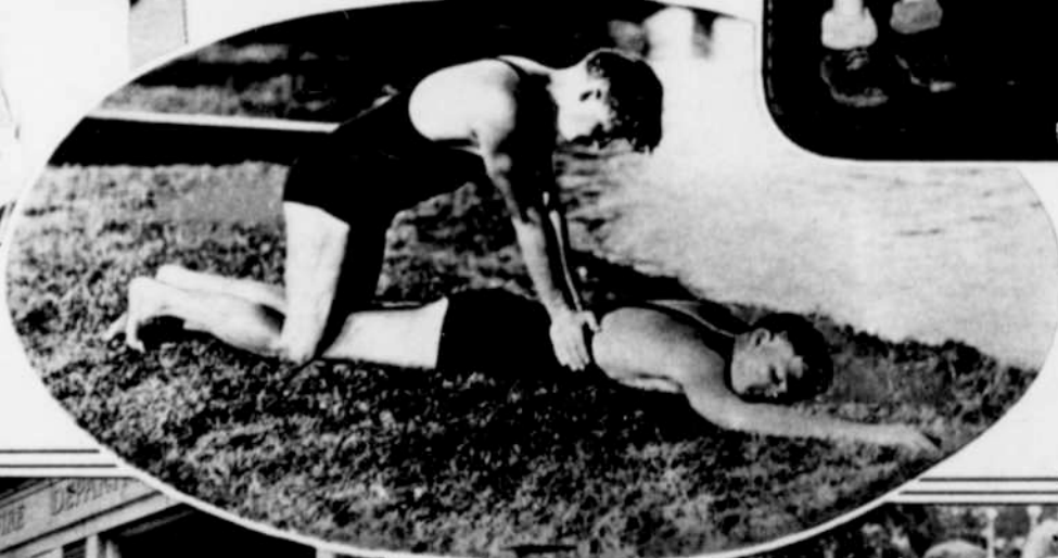
SAVING A LIFE —Red Cross Life Saver demonstrates prone pressure method of resuscitation of drowned person.

A YEAR OF RED CROSS SERVICE 145,000 families aided in Spring floods and tornadoes. Relief fund of $7,800,000 given by public for these disaster victims. Help given in 136 other disasters in nation. Red Cross public health nurses made 1,000,000 visits to sick. 212,000 First Aiders and 80,000 Life Savers trained. First Aid and Life Saving taught 75,000 C.C.C. enrollees. 700 First Aid Stations in operation on highways to cut motor accident death toll—3,500 stations being organized. Chapters gave Civilian relief in 800 communities. Home Hygiene and Care of the Sick taught to 50,000 persons. 8,000,000 school boys and girls enrolled in Junior Red Cross. Service to disabled veterans and service men continued. Thousands of volunteers made garments, braille books and gave varied services. These activities carried on in 13,000 communities by Red Cross Chapters and Branches.