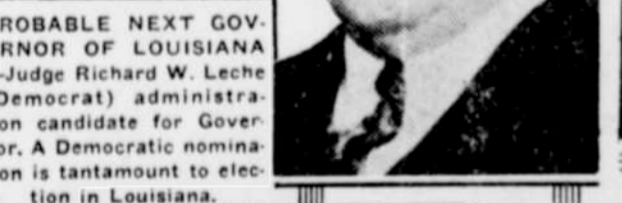
PROBABLE NEXT GOVERNOR OF LOUISIANA—Judge Richard W. Leche (Democrat) administration candidate for Governor. A Democratic nomination is tantamount to election in Louisiana.