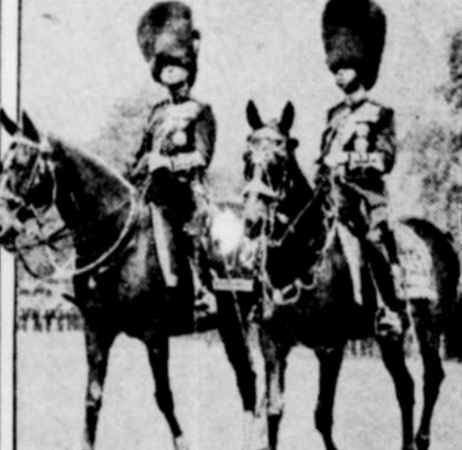
ENGLAND'S NEW KING—His Royal Majesty King Edward VIII and his brother, the Duke of York, (left to right) in full uniform as they celebrated their father's 70th birthday at the trooping of the colors ceremony on the Horse Guard Parade in London, last June.