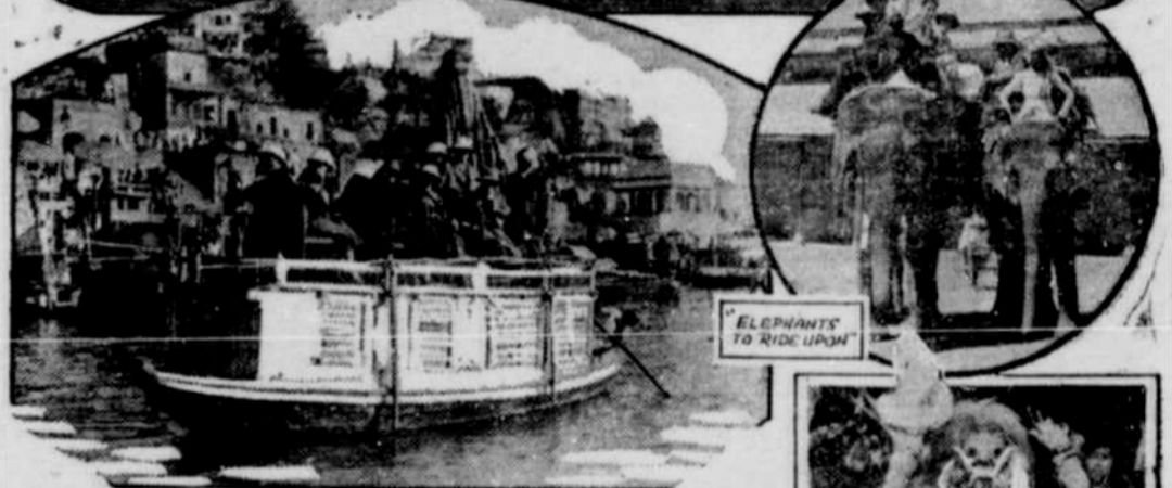
CRUISE PASSENGERS AT BOMBAY, INDIA

Nowadays, when it is about as cheap to go around the world as it is to remain at home, thousands of travel-minded people embark upon this greatest of sea adventures. So many friends have looped the world loop that one feels a bit out of the picture if one has not circumnavigated the globe on a floating palace like the "Empress of Britain," 42,500 tons gross register, which will leave New York Jan. 4, 1934, on a 30,000-mile world cruise, visiting 66 ports and 34 countries. One hundred and thirty joyous days on the largest and most beautiful ship that crosses across the Seven Seas! Her new sailing schedule permits one to spend Christmas and New Year's at home. Returning she will steam through the Golden Gate, San Francisco, April 25, and pass the Statue of Liberty, New York Harbor, May 15.