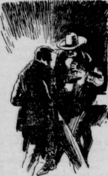
"Shot!" He Muttered. "Shot!"

"Shot!" he muttered. "Shot . . . and . . . and—" He threw out a hand awkwardly for