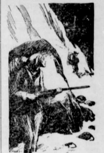
She Thought That He Was Going to Pass Without Seeing Her.

He could not understand. Not yet. All that he could do was stare at her and wonder and grope confusedly for the explanation. It was clear that something was wrong with Gloria;