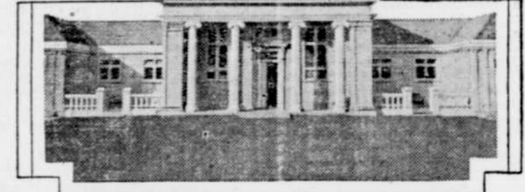
Government Bath Building and One of Pools.

CHICAGO—The new Government bath emporium at Rotorua, New Zealand, erected over a boiling mud pool that constantly emits deadly gases which quickly destroy ordinary construction materials, is attracting the attention of architects, builders and engineers throughout this country because of the American products used in the structure. Great difficulty was experienced not only in erecting the building, but in obtaining materials for its construction that would withstand the tremendous heat and the disintegrating effect of the carbonic and sulphuric acid and sulphuretted hydrogen gases of the pool. During certain phases of the construction, the workers were compelled to wear gas masks, into which fresh air had to be pumped constantly during their operations. Boards made of preswood material manufactured at Laurel, Miss. were used for panelling the walls and ceilings throughout the building. In one of the bathing pools enclosed within the structure, the bricks had to be specially made of leadless glaze and laid in molten sulphur, as cement disintegrated rapidly in the waters of the pool. The erecting engineer states that one of the only metal having better properties in this building, as anything with lead or copper as part of the alloy quickly disintegrates.