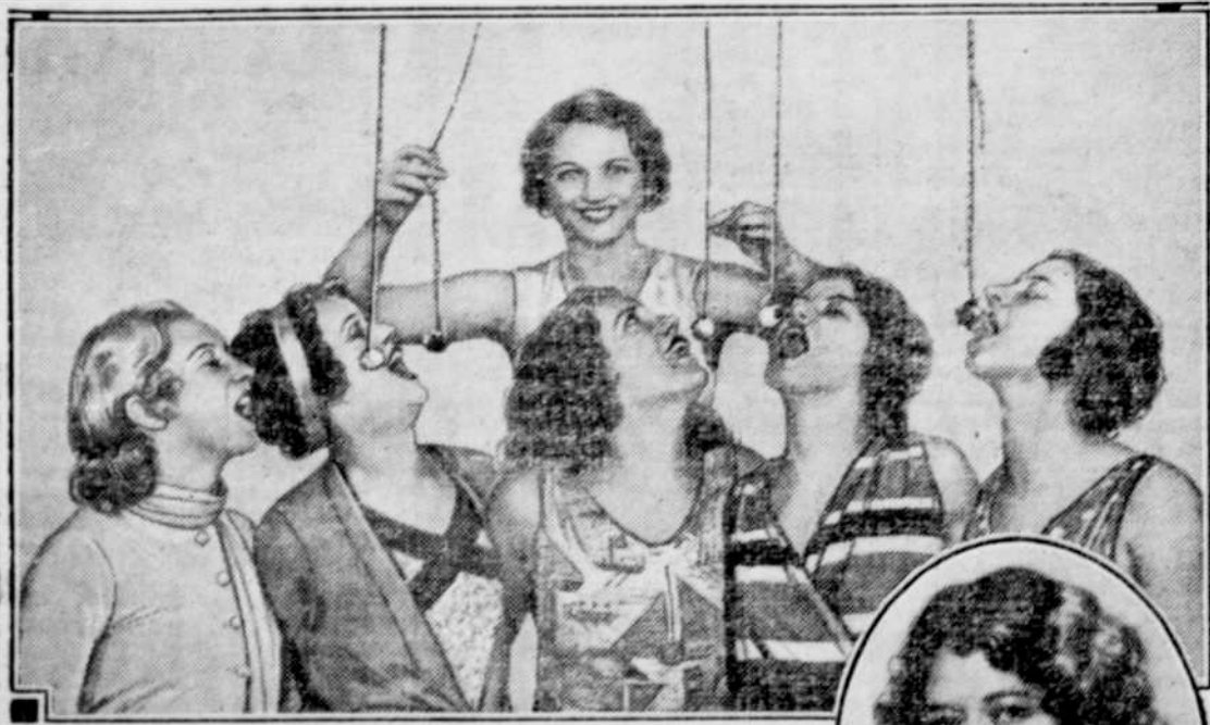
A bevy of beauties from "Everybody's Welcome," a current Broadway production, show how it's done. (At right) Ann Pennington who revived the "bobbing" past-time.

BROADWAY, some folks seem to think is the last place in the world to look for old-fashioned ideas or customs. Maybe so, but believe it or not, those "pretty potatoes" as the columnist says, who dance behind the footlights, have gone back to grandmother's diary for some bright new ideas on how to pass the time between acts and after. For instance, they take a long piece of string and fasten one end to the overhead plumbing,