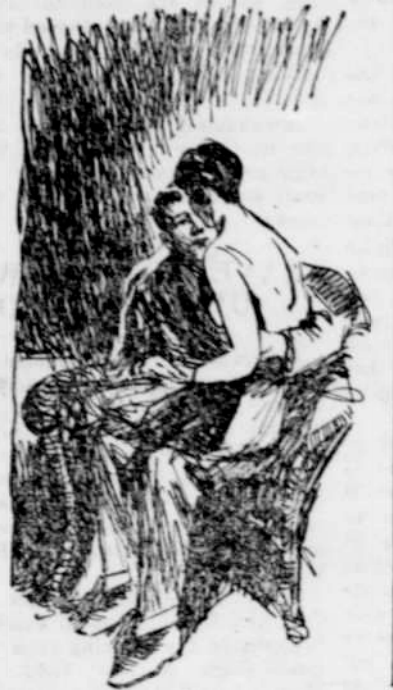
She Was Setting on My Knee By and By—I Don't Know Where I Had Found a Chair.

In the midst of the clamor, I gathered my goods and escaped, thankful to have passed the barrier that I had