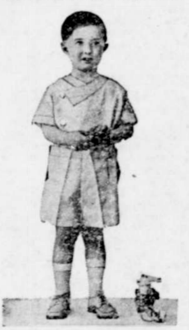
Trousers Buttoned on a Blouse.

It is easier to teach a boy between two and three years old how to dress himself and go to the toilet without help if one type of trouser fastening is adopted for all of his suits. Variations in material, color, and minor style details can be introduced. A very good type for the small boy's trousers is here illustrated. It was designed by a clothing specialist in the bureau of home economics, United States Department of Agriculture, after studying the needs of a group of nursery school children. These trousers button on a blouse in Oliver Twist style, or they can be worn on an underbody or sun suit top, depending on the season. The important new feature about them is the drop front formed by slashing the front section midway between the side pockets and center seam. The slashes are finished with simulated welt pocket edges which are really plaquettes. The band at the top of this front drop is extended about an inch to form convenient tabs and permit the button-