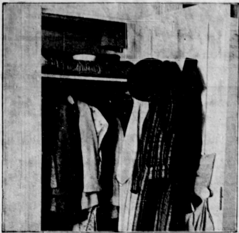
Closet Prepared for Fumigation Against Moths.

(Prepared by the United States Department of Agriculture.) If you have a roomy closet with a tight-fitting door and smooth uncracked walls, you can use it for fumigating wool garments before storing them over the summer.