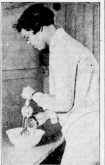
Don't Stoop Over to Beat Eggs or to Do Other Household Tasks.

Extension workers among farm women in many states have recently been stressing the importance of good posture and working levels suited to the individual.