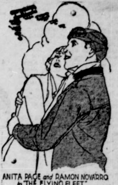
ANITA PAGE and RAMON NOVARRO in "THE FLYING FLEET"