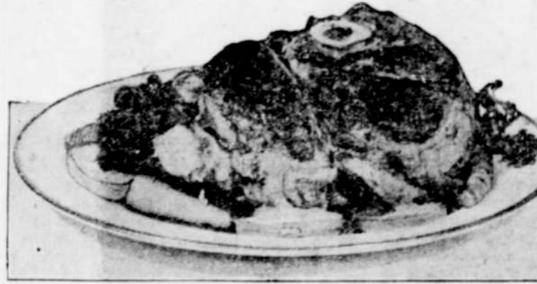
Pot Roast of Beef With Vegetables.

(Prepared by the United States Department of Agriculture.)