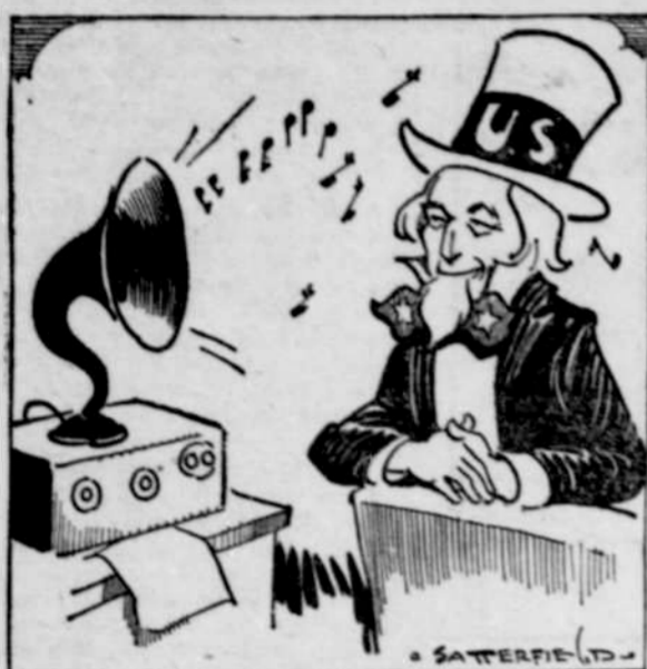
3. As head of the radio, he issued the first broadcasting license in history.