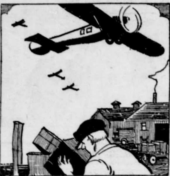
4. He has laid great stress on commercial aviation and has stimulated its development.