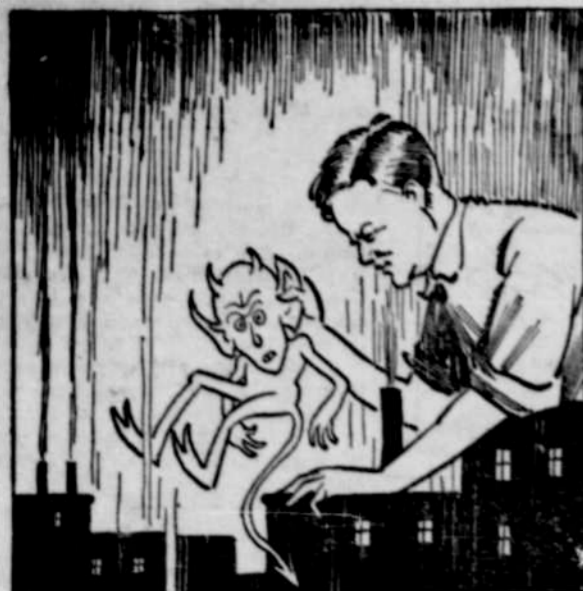
1. One of Hoover's greatest hobbies has been the elimination of waste in industry.