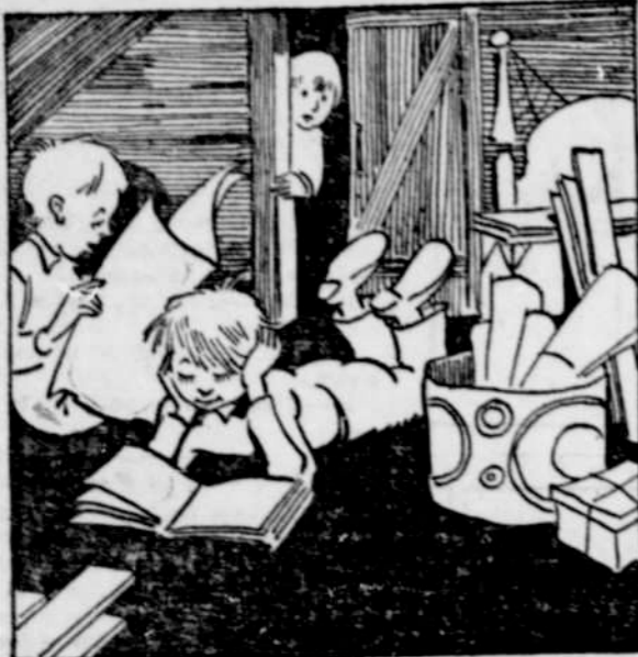
3. The children's playhouse was the farm attic, where they read Youth's Companion and Robinson Crusoe.