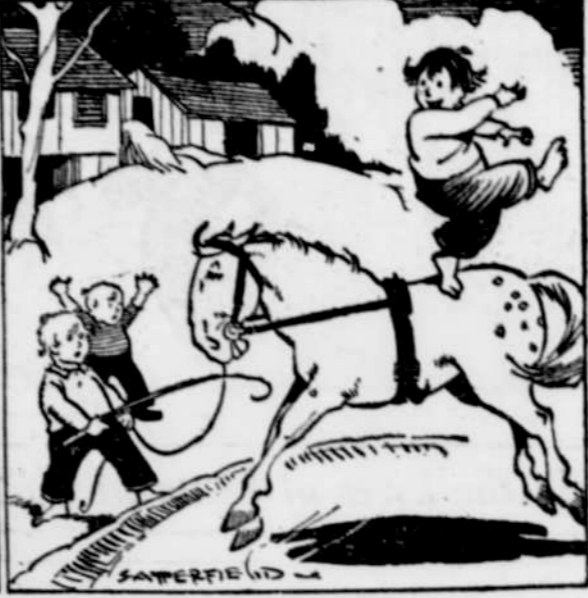
4. First prize always went to Herbert when the children played circus with Uncle Benajah's old white mare.