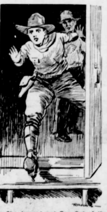
Up She Jumped and Ran Out of the Door.

Wade shrugged his shoulders. "I don't know for sure," he answered.