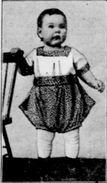
A Good Type of Romper of Two Materials—Front View.

(Prepared by the United States Department of Agriculture.) Here is a romper liked by many mothers for little runabouts between a year and a half and three years old.