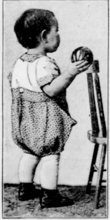
Back View of Child's Romper, Showing Placing of Buttons at Side and Back.

of dark materials often needed for mornings spent at the sand pile. A romper of this kind is appropriate at any time of day.