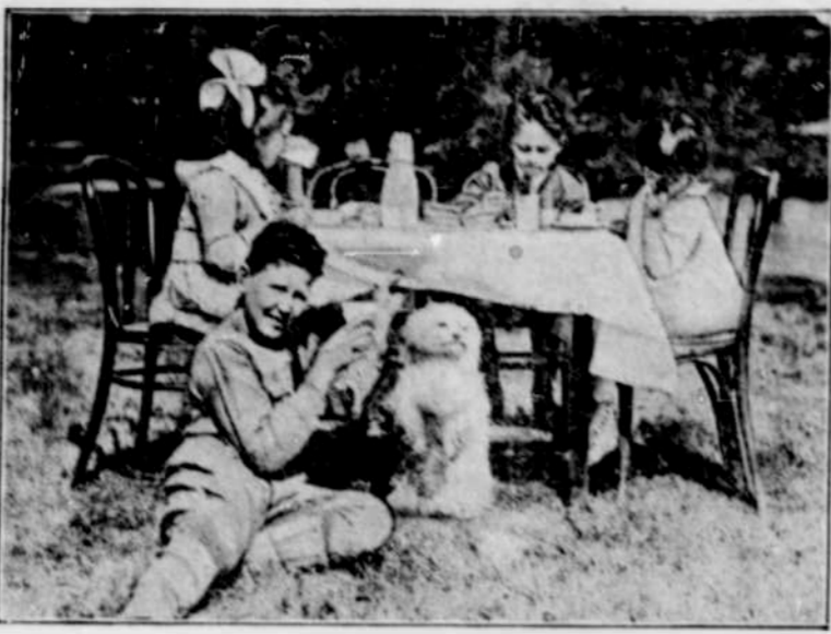
Even at Picnic Parties Milk is Important.

Let the children lunch out of doors frequently in the good weather of the next few months, suggests the United States Department of Agriculture.