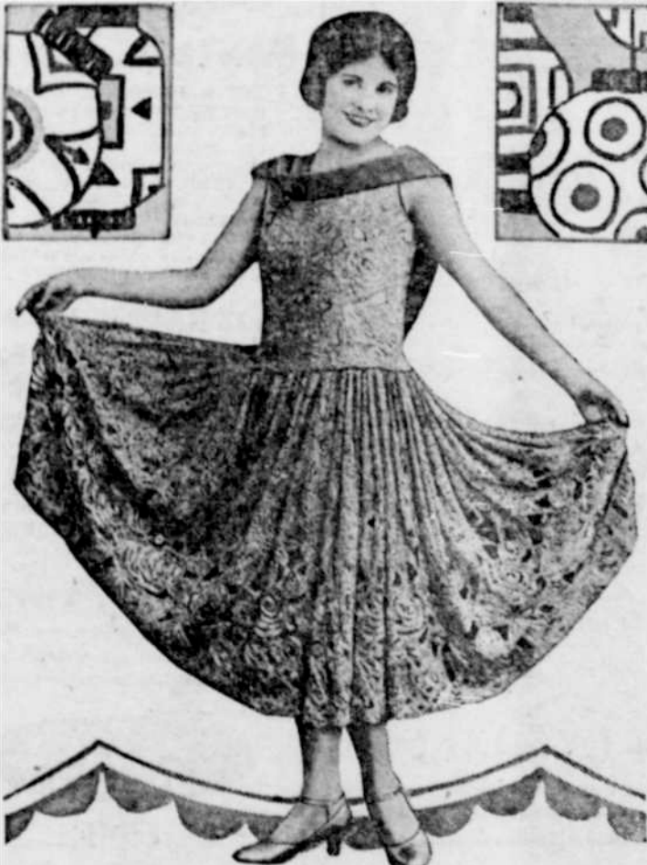
FOR DANCE OR EVENING

For the dance, choose a frock all of lace and be in fashion. The one in the picture is a lovely ingenue type. Its full skirt and semi-fitted bodice emphasizes the trend toward a normal waistline. We bear considerably these days about a return to the natural waist line. Both lace and flowered chiffon dresses usually have a touch