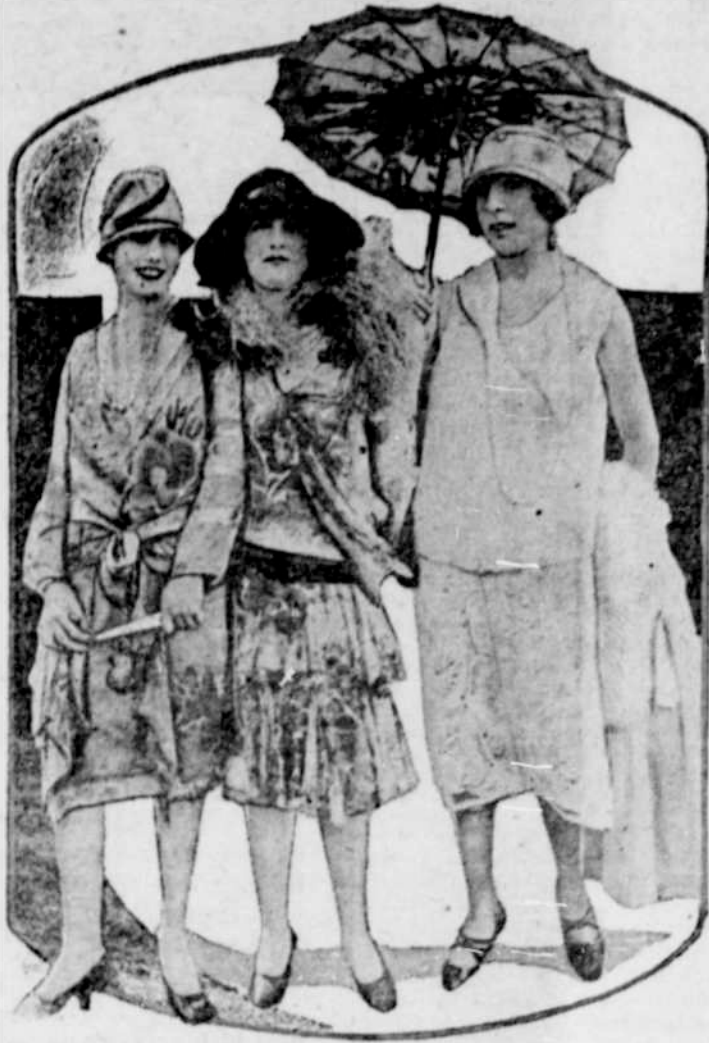
SUGGESTION FROM PARIS

ence upon present modes, in the vocabulary. That word is lace. One simply cannot follow in the footsteps of fashion, without encountering lace at every turn. This domination of lace in the style world may rightfully be accepted as a declaration that the much-heralded feminization of the mode is indeed at hand. We have, undoubtedly, entered a period of picturesque styling in which lace, ribbon, floppy big brimmed hats, sheer fabrics in flower tints and all the charming frivolities which go with such, play leading roles.