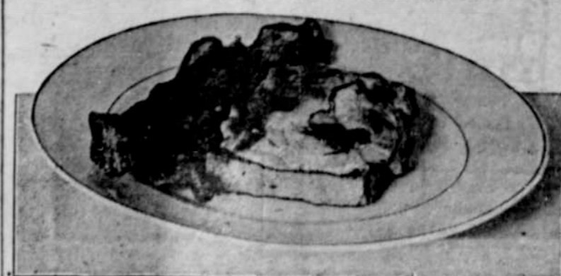
Cheese Mixture is Tender and Easy to Prepare.

Here's a new kind of cheese toast, made with cream of neufchatel cheese. The cheese mixture when it comes from the oven is golden brown and tender and is easier to prepare than the kind made with American cheese.