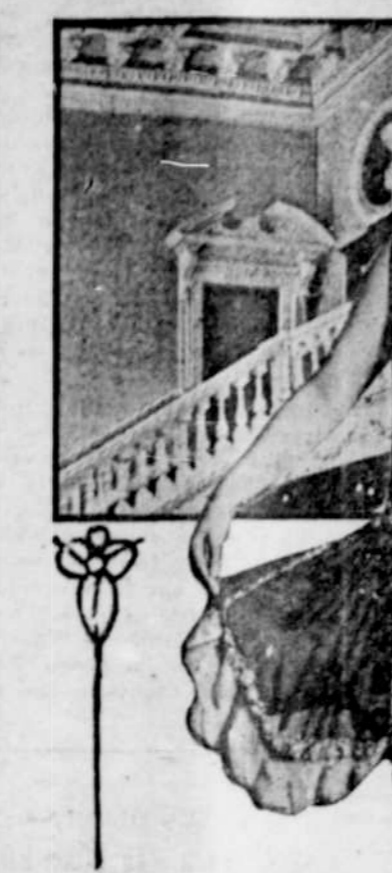
Alluring Evening Dress of Black Chiffon.

SEEKING that the charm of the "sweetly feminine" is fashion's favorite theme, chiffons and kindred diaphanous fabrics have assumed a position of foremost importance for the making of afternoon and evening frocks.