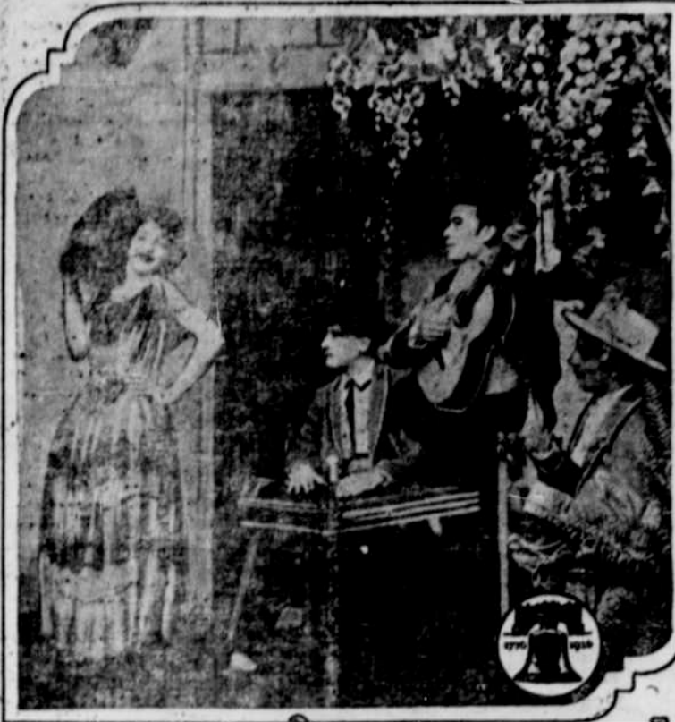
These entertainers have been brought to the Sesqui-Centennial International Exposition in Philadelphia whose 150 years of American Independence is being celebrated, by the Los Angeles County, California, Chamber of Commerce. The westerners have built a fine old Spanish mission in the Palace of Foreign, Civic, Fashion and Agriculture Display and there show the resources and advantages of their native land. The musicians and dancers entertain all visitors who enter the patio to rest a bit after "doing the exposition." The Exposition continues until December 1.