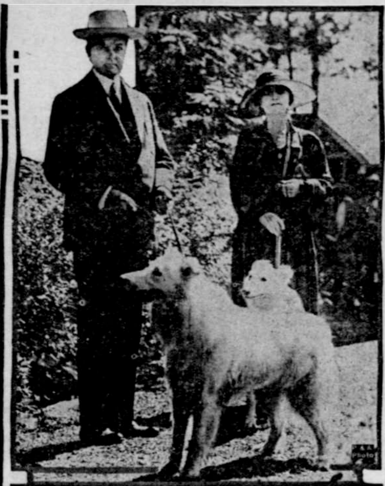
President and Mrs. Coolidge with their dogs, Rob Roy and Prudence Prim, going for a walk at White Pine camp on Osgood lake, shortly after their arrival at the elaborate Adirondacks camp.