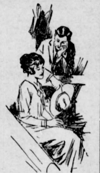
Constance Dropped Her Eyes to Her Clasped Hands.

Even that had passed. A mining camp runs with bewildering speed its course from birth to senile decay. Twenty years of Europe! In a month Cottonwood lived a cycle of Cathay. Before August blew the petals from