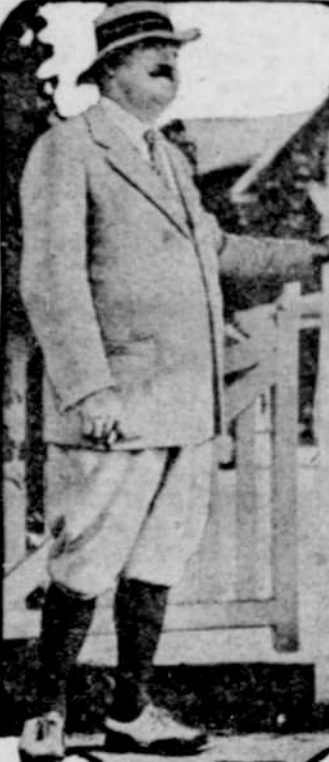
John Drew, veteran American actor, here seen at his home in East Hampton, L. I., has retired to private life. Celebrating his seventy-third birthday, he attended the annual dinner of the local volunteer fire department and mentioned the fact that it would be his last public appearance.