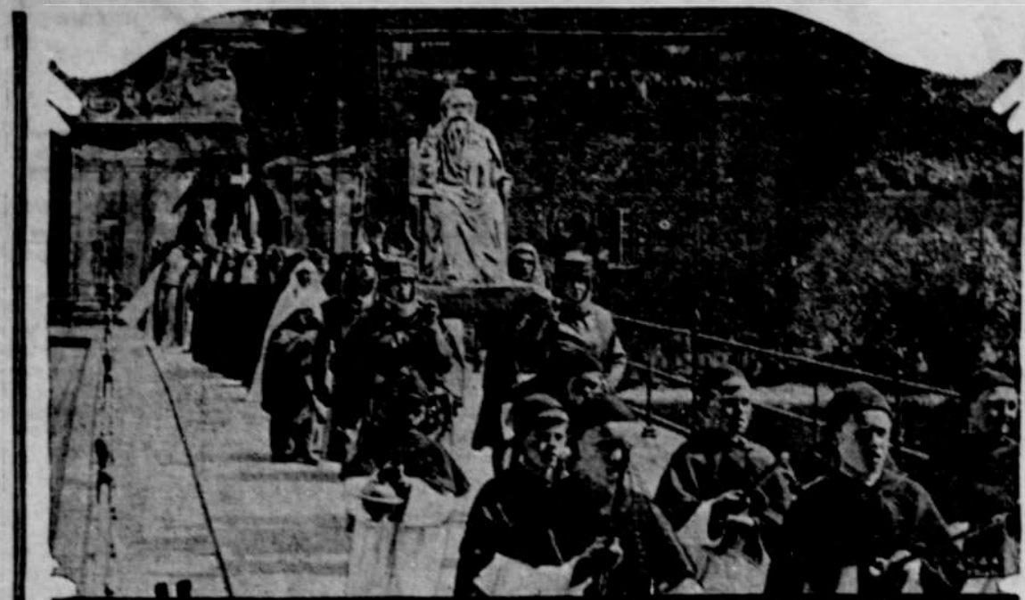
Elsinore, the Danish city of Hamlet, recently held an elaborate festival to celebrate the five hundredth anniversary of the granting of the charter. Pageants recalling the history of the town were acted in the courtyard of Kronborg castle, where the "Taming of the Shrew" was also presented. This picture shows nuns following the effigy of a saint which is being carried by mail-clad knights.