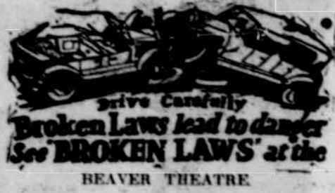
Drive Carefully Broken Laws lead to danger See "BROKEN LAWS" at the BEAVER THEATRE

Mrs. Wallace Reid Honestly Hopes That All Parents Will See This Big Production "FRIENDLY EMBARRASSED" A Wonderful Comedy International News BIG COUNTRY STORE LOTS OF MERCHANDISE GIVEN AWAY FREE Special Music Sunday—and Remember Monday Night's Country Store ADMISSION PRICE ONLY 10 CENTS & 25 CENTS