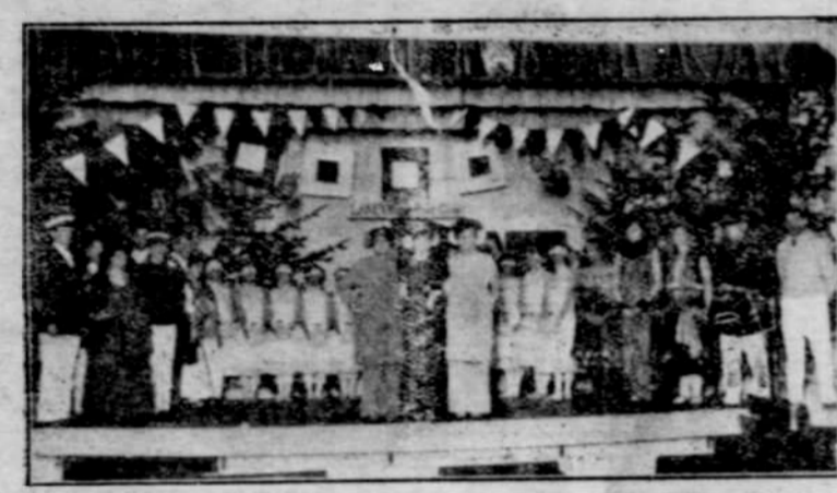
Flashlight Taken of Cast At High School Operetta