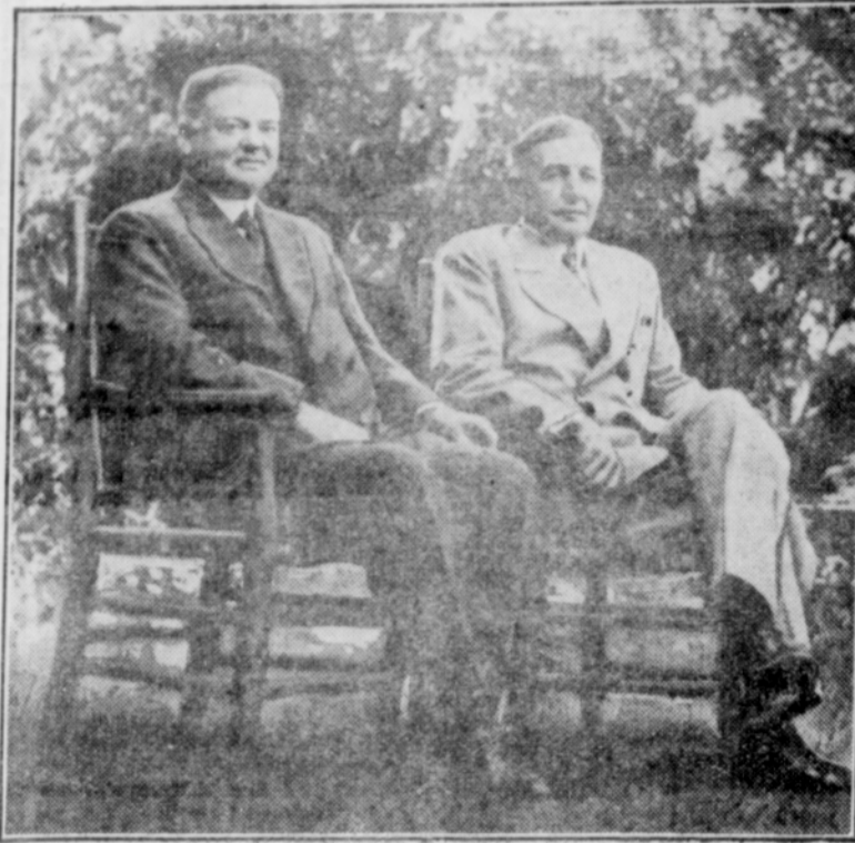
HERBERT HOOVER and Vice-President Dawes on the grounds of the latter's home in Evanston, Ill., where the vice-president offered to take the stump during the Hoover-Curtis campaign.