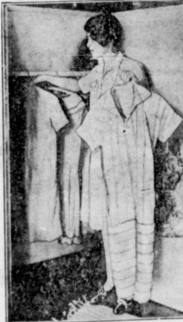
Making the Closet Orderly.

Having the closet arranged so that it was just as easy to put things away