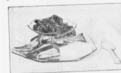
Apricot and Pineapple Jam With Cheese.

The United States Department of Agriculture has a bulletin on making cream cheese of the Neufchatel type.