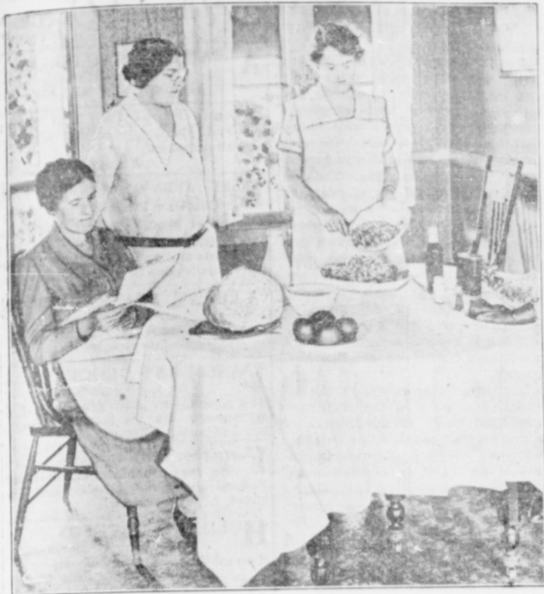
Salads Made With Cabbage.