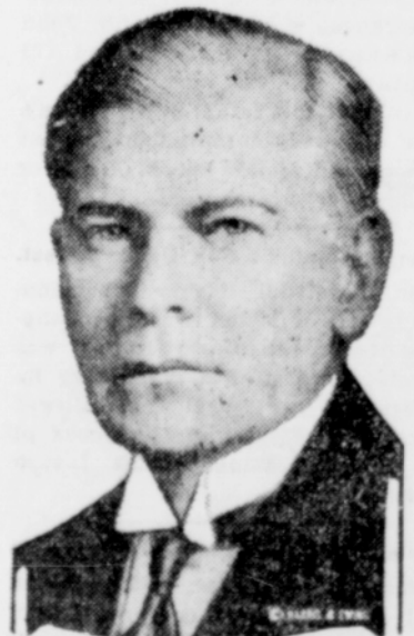
Most recent photograph of Elmer Thomas, the new United States senator from Oklahoma. He succeeded John William Harrell.