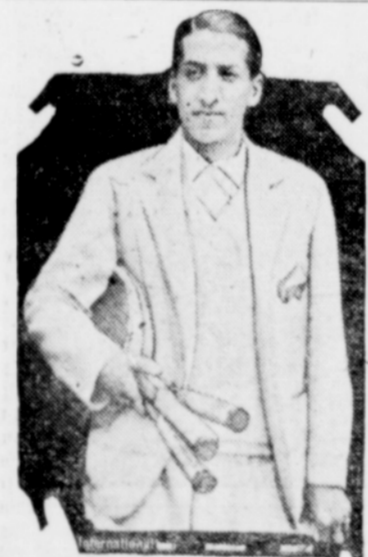
Jean Repe Lacoste, tennis champion of France and the United States, conqueror of William T. Tilden, has abandoned the courts until next May, and is devoting his entire time to the motor business, automobile and airplane.

NOTICE: There will be a motion picture show at the City Hall, Halsey, every Tuesday night. Good features will be shown. Bring the kiddies.