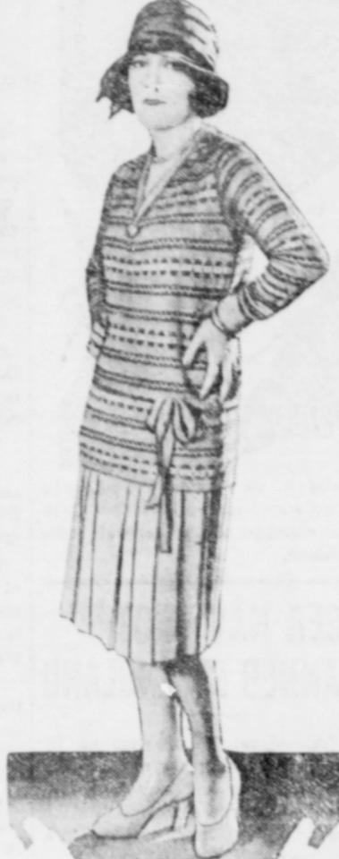
A practical costume for general day time wear through the winter is this smart sweater costume worn by Alleen Pringle, Metro-Goldwyn-Mayer star.

The skirt of beige cashmere is box plaited and the striking sweater has the basic color of beige, with a formal pattern of yellow, brick red and black.