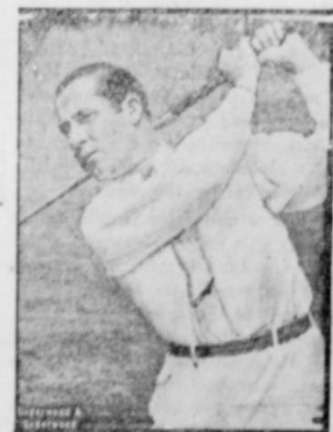
The photograph shows Walter Hagen, one of the nation's greatest exponents of golf and winner of the western open championship.