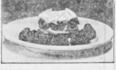
Individual Strawberry Shortcake.

An attractive way to serve strawberry shortcake is to have what the Chinese call "each-person" portions. Use your own recipe for biscuit dough, but make it somewhat richer than usual. One-third to one-half cupful of fat to each three cupfuls of flour is a