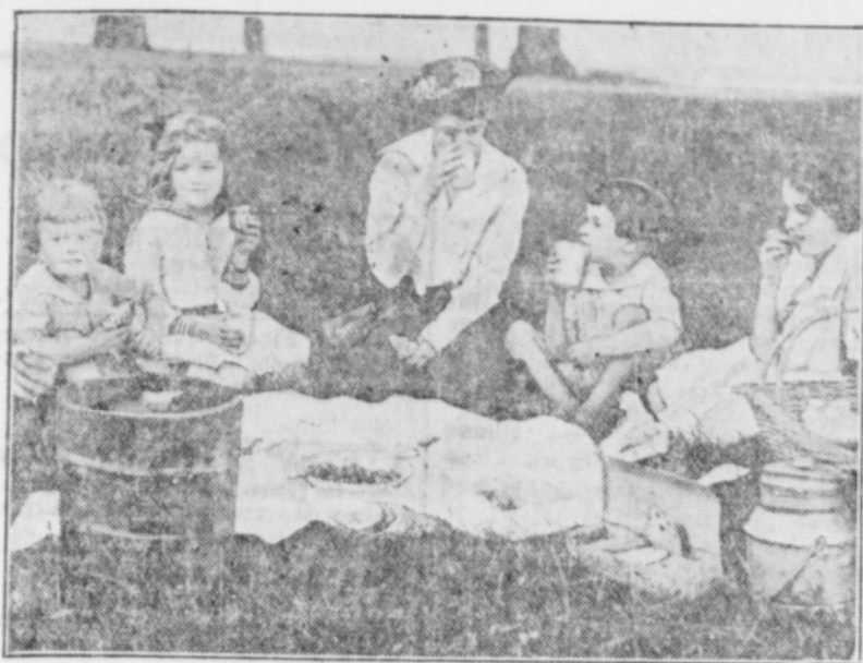
Why Not Take the Ice Cream Freezer Along?

(Prepared by the United States Department of Agriculture.)