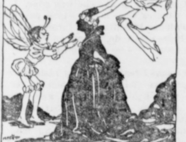
Made Out of Mud.

"We'll have a mud palace," said one little fairy. "A real castle with courtyards, and secret passages, and a