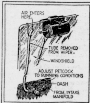
More Mileage on Long Runs.

If you car is fitted with an automatic windshield wiper of the vacuum operated type you can fit an auxiliary air inlet to get more mileage out of your gasoline on long runs. Connect a petcock in the rubber hose line lead-