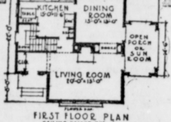
FIRST FLOOR PLAN Ceilings 8'0" to 8'6"

this type of house affords the utmost in light and cross-ventilation, it would be well to protect it against the extremes of cold and heat by insulation with celotex for the walls and roof. Such insulation will also cut down outside noises to a marked degree, as in addition to its insulating property, celotex is an efficient sound deadener. The living room has the much desired open fireplace and cleverly arranged bookshelves flanking the entrance to the dining room. The sun porch may be put either to the side or the back of the house, according to the builders' wishes or to conform to the demands of the lot.