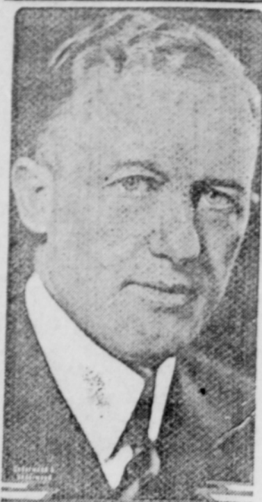
Attorney-General Dan Moody, who ran ahead of Governor "Ma" Ferguson in the Texas gubernatorial primaries.

Big Liquor Cargo is Taken. New York.—The British auxiliary schooner Mulhall was seized off Fire Island with a cargo of alleged whisky and malt valued at $90,000.