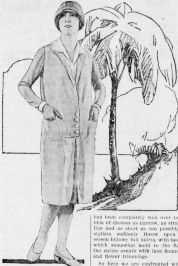
A One-Piece Model.

WHILE praise of the two-piece dress is being shouted from the housetops of fashionland the aristocratic one-piece tulleur, such as the picture shows, goes quietly and elegantly on in the tenor of its way. In fact, the coat street dress has not lost in prestige. Of course as an exponent of ultrasmartness it must be fashioned of cloth of first quality, displaying correct detailing of collar, one which will give eminent satisfaction from the standpoint of both utility and arresting appearance, is of covert cloth made in double-breasted fashion, featuring sleeves that fall into a wrist band. In what a capricious mood do we find fashion these days. Especially in the matter of party frocks and formal evening gowns, the mode has gone to extremes. Just as millady