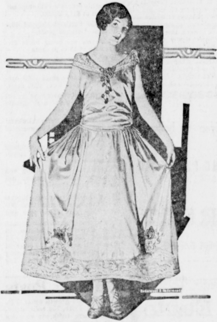
Showing the Full-Skirted Mode.

silk, crepe or satin collars, cuffs and vestees, the last word from Paris favors fascinating delicate pink tints.