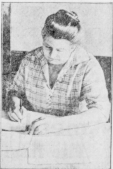
Farm Woman Keeping Her Farm Records and Household Budget.

First, estimate the size of your income for the coming year, without being too optimistic. Put down what you are fairly sure you will have. It is always easier to spend a bit of