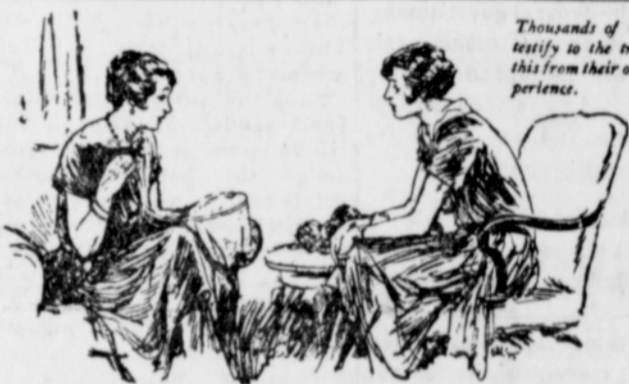
Thousands of women testify to the truth of this from their own experience.