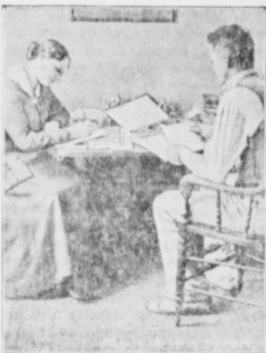
Making a Family Budget Saves Worries.

The United States government is wondering how it ever got along without a budget, and the homemaker who has tried such a spending plan for the family income feels the same way. This scheme of spending the income on paper first gives a sense of financial security. It is the only way to make sure that every member of the family will get his just share of the family income, that all necessary expenses can be met, and that a fair portion will be saved for future needs. Such a budget is comparatively easy to make and far easier to live up to