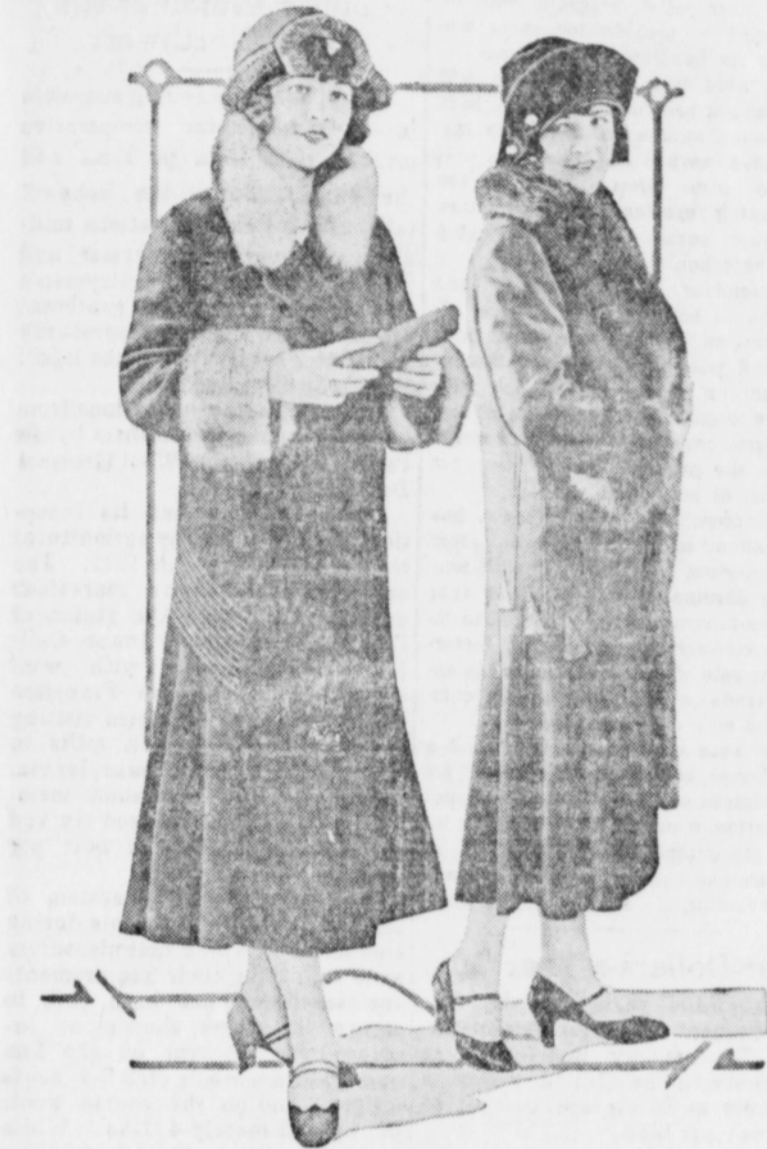
MODELS FOR MIDSEASON WEAR

Only a woman who thinks before she speaks can economize on talk.