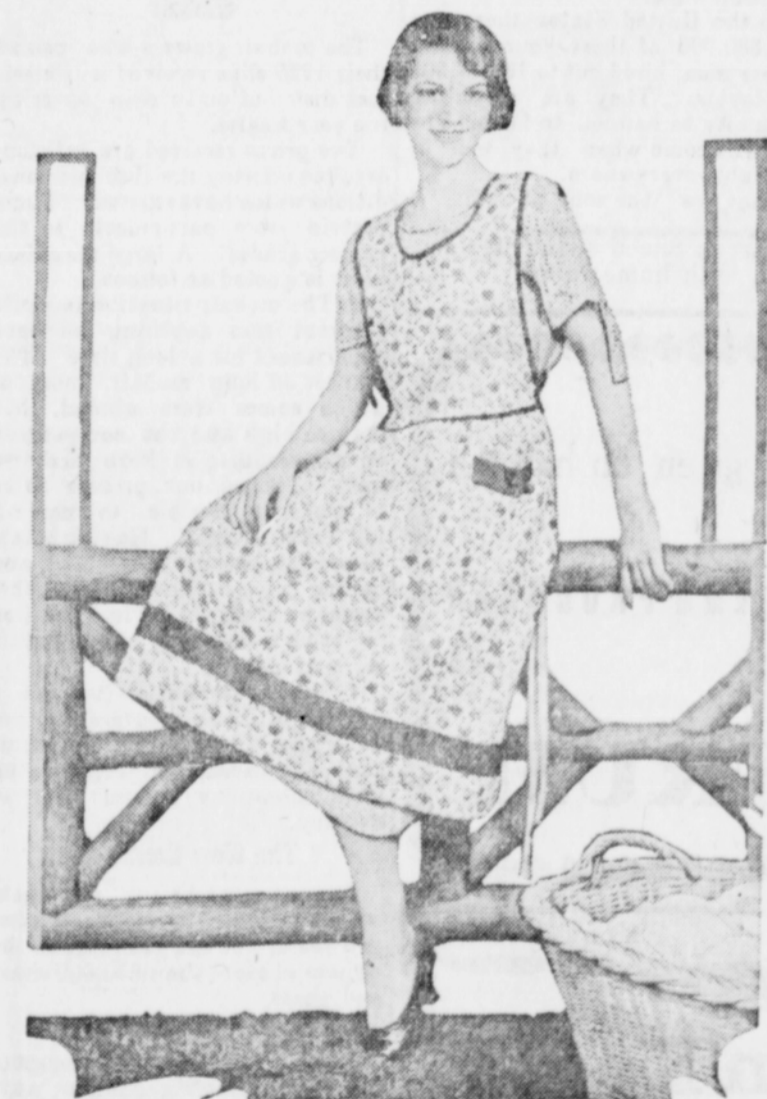
A VERY CUNNING APRON

By the way, a cretonne apron makes a lovely valentine gift. One could