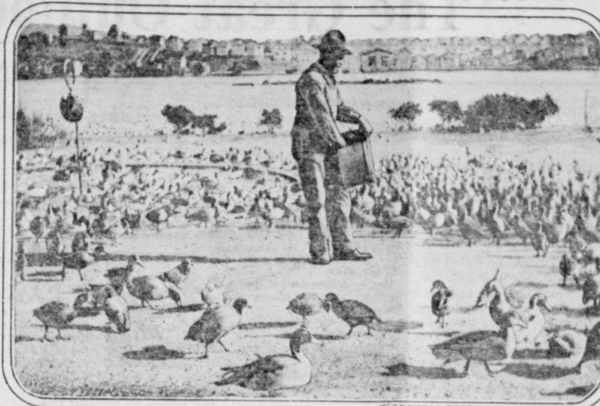
WILD DUCKS IN OAKLAND, CALIF.