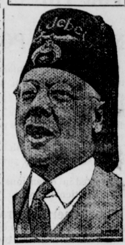
Denver, who was elected imperial potentate by the Shriners in conven tion in Los Angeles.