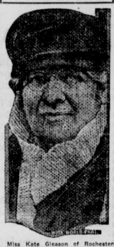
N. Y., who is the only woman member of the American Society of Engineers.

Solution of Puzzle No. 28. CENTRIFUGAL AMSIAMESEMA OFTEPEENAM BOYEVAN TEMPERAMENT TAMERIA RAISAMSI PANOPLYNO ELIMINATION