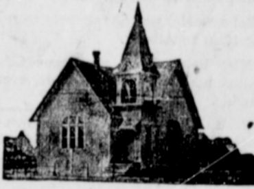
Halsey Church of Christ

The Albany Democrat kindly permits the Enterprise to present the above pictures of the proposed Harrisburg and Albany bridges from cuts it procured from the Portland Telegram. The upper picture shows the Harrisburg plan, looking downstream, road to be 24 feet wide, with a 6-foot sidewalk, and cost $203,500. In the center is the Albany plan, 27-foot roadway and two 6-foot sidewalks; cost, $295,500. Below is the proposed bridge approach at Albany.