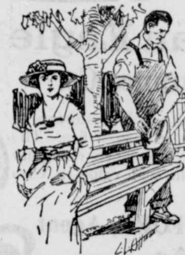
"You Marry! Humph!"

"It seems as if it ought to be possible," said Jim, "for a man to do work on the farm, or in the rural schools, that would make him a livelihood. If he is only a field-hand, it ought to be possible for him to save money and buy a farm." "Pa's land is worth two hundred dollars an acre," said Jennie. "Six months of your wages for an acre—even if you lived on nothing." "No," he assented, "it can't be done, and the other thing can't, either. There ought to be such conditions that a teacher could make a living." "They do," said Jennie, "if they can live at home during vacations. I do."