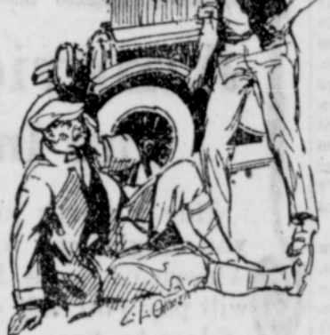
Jim Countered With an Awkward Upper Cut.

The chauffeur, however, unfurlingly released Newton, and furiously delivered a blow meant for Jim's jaw, which miscarried by a foot. In reply, Jim countered with an awkward