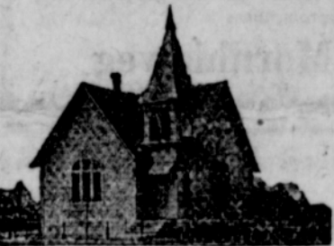
Halsey Christian Church