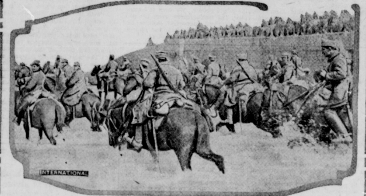
Greek cavalry are here seen retreating before the victorious troops of Mustapha Kemal Pasha which finally drove the Greeks out of Asia Minor.