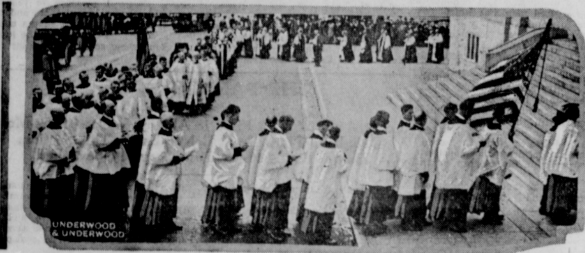
Part of a procession of bishops at the general convention of the Protestant Episcopal Church in America at Portland, Ore.