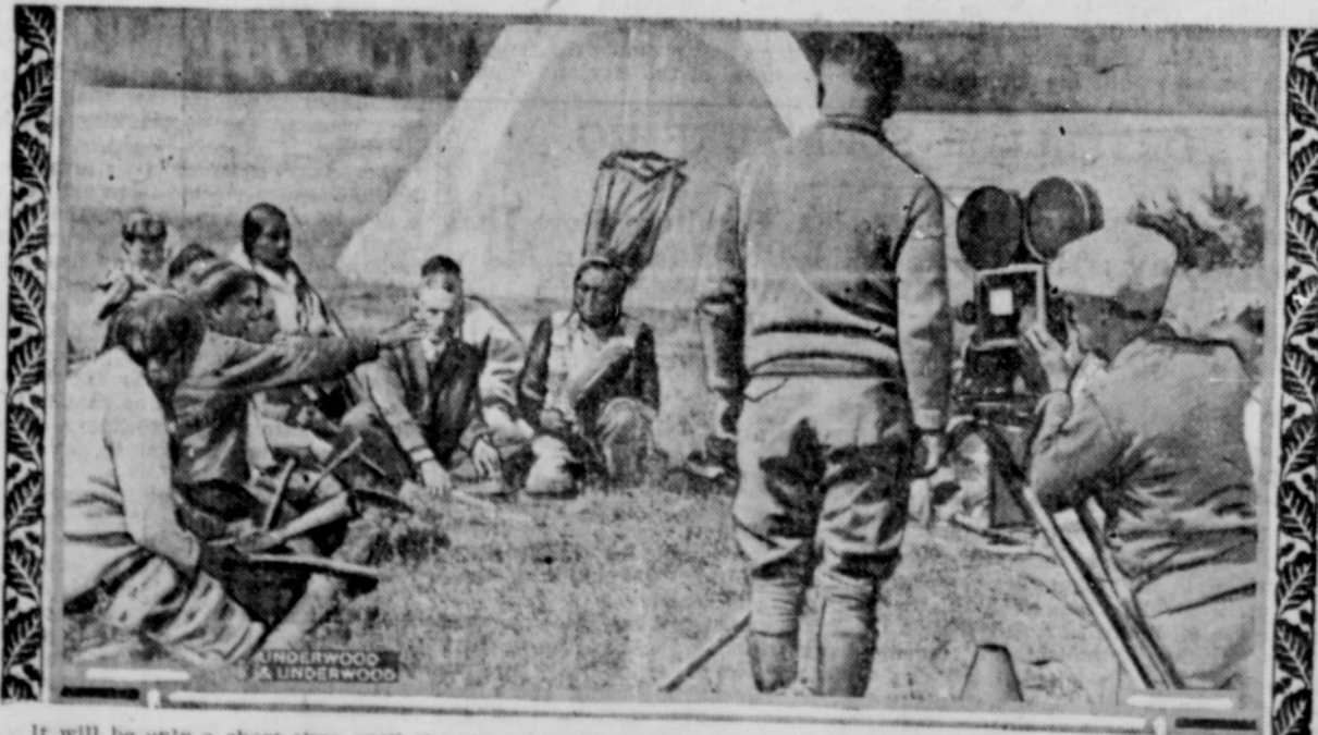
It will be only a short time until the old chiefs of the Blackfeet Indian tribes will have disappeared from the earth. In view of this fact the government has decided to make a permanent record of what remains of their peculiar type of civilization. For the past two months a camera crew has been working in Glacier National park, filming the Indians in their home life, their dances, their tribal gatherings, their sacred medicine ceremonies and other forms of their work and play. The film will be preserved for educational and historical purposes.