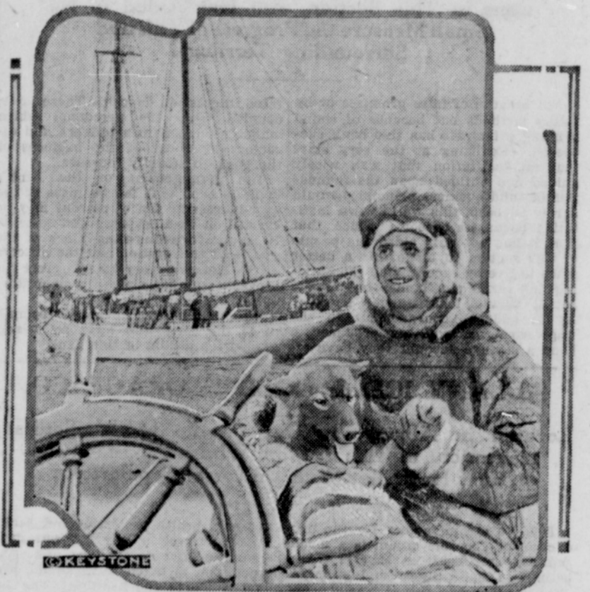
Capt. Donald B. MacMillan, arctic explorer, and the schooner Bowdoin on which he and his expedition have just returned from an exploration of Baffin Land. MacMillan is holding See-nul-muk, one of the dogs that were with the expedition.