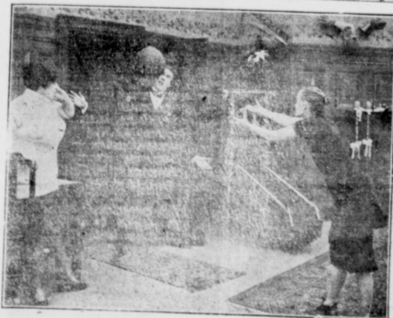
Scene from "The Lottery Man," Halsey opera house June 26