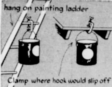
Clamp where hook would slip off

A painter friend of ours told us about this time-saving idea. With an ordinary C-clamp, you can hang a paint bucket on almost any projection, or on the rung of the ladder you're using.