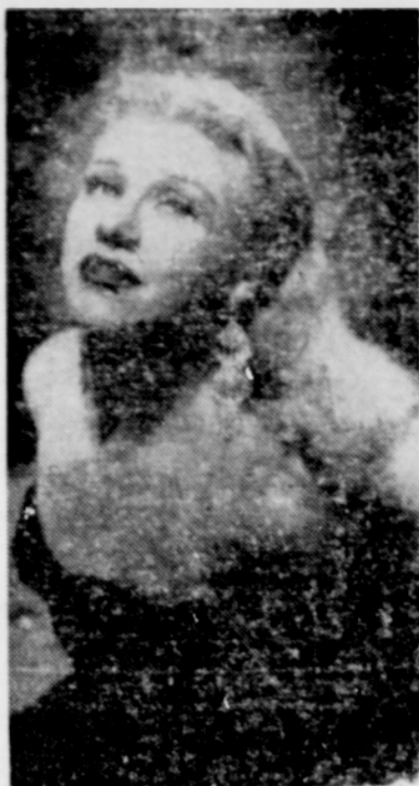
Atlas Features Photo

Of Ginger Rogers' elaborate new three-tiered earrings, psychologists warn—"You're older than you think if you notice the baubles until after you've stared at Ginger for quite some time two or three seconds, anyhow."