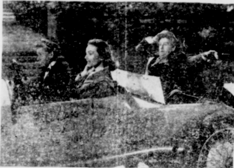
Clifton Webb gets the ride of his life in this scene from the technicolor production "Cheaper By The Dozen"