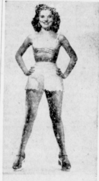
Debra Paget is reason enough for us to flock to the beach when she's there. Do you agree?

All cars have running ice water, extra large no-fog windows, "feather-touch" doors, individually controlled fluorescent lighting and heating to supplement the train's improved air-conditioning system. Mattresses and seats are of foam rubber, and interior colors and fabrics are in colors and designs symbolic of the beauty of the country the train serves.