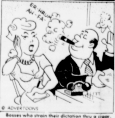
Bosses who strain their dictation thru a cigar.

614 Mead Building, Portland, or any local Oregon State Employment service office. Last date for filing for the Income Tax Auditor I examination and the Appraisal Engineer I examination is July 15, 1950; for the Librarian I test, also open to residents of other states, the last filing date is July 29, 1950.