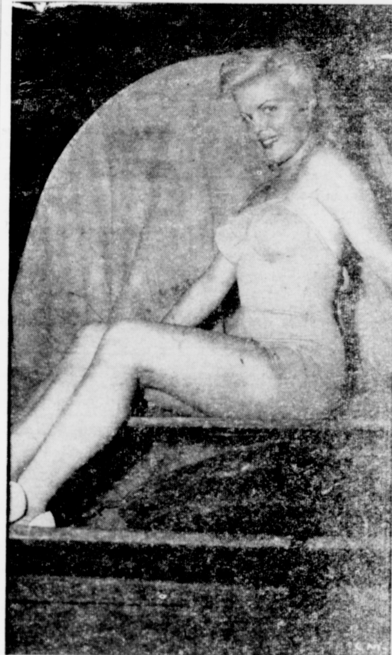
The spotlight fell on Cleo Moore as this picture was snapped. What better surprise can a cameraman get than this bundle of pulchritude?