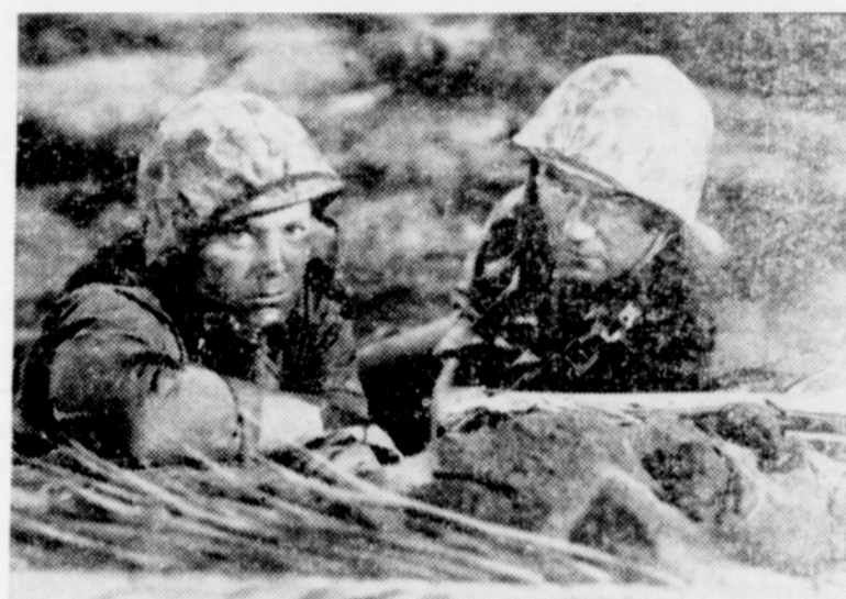
John Wayne is a tough sergeant in "Sands Of Iwo Jima," a story of the Marine Corps' toughest battle. John Agar is also starred.